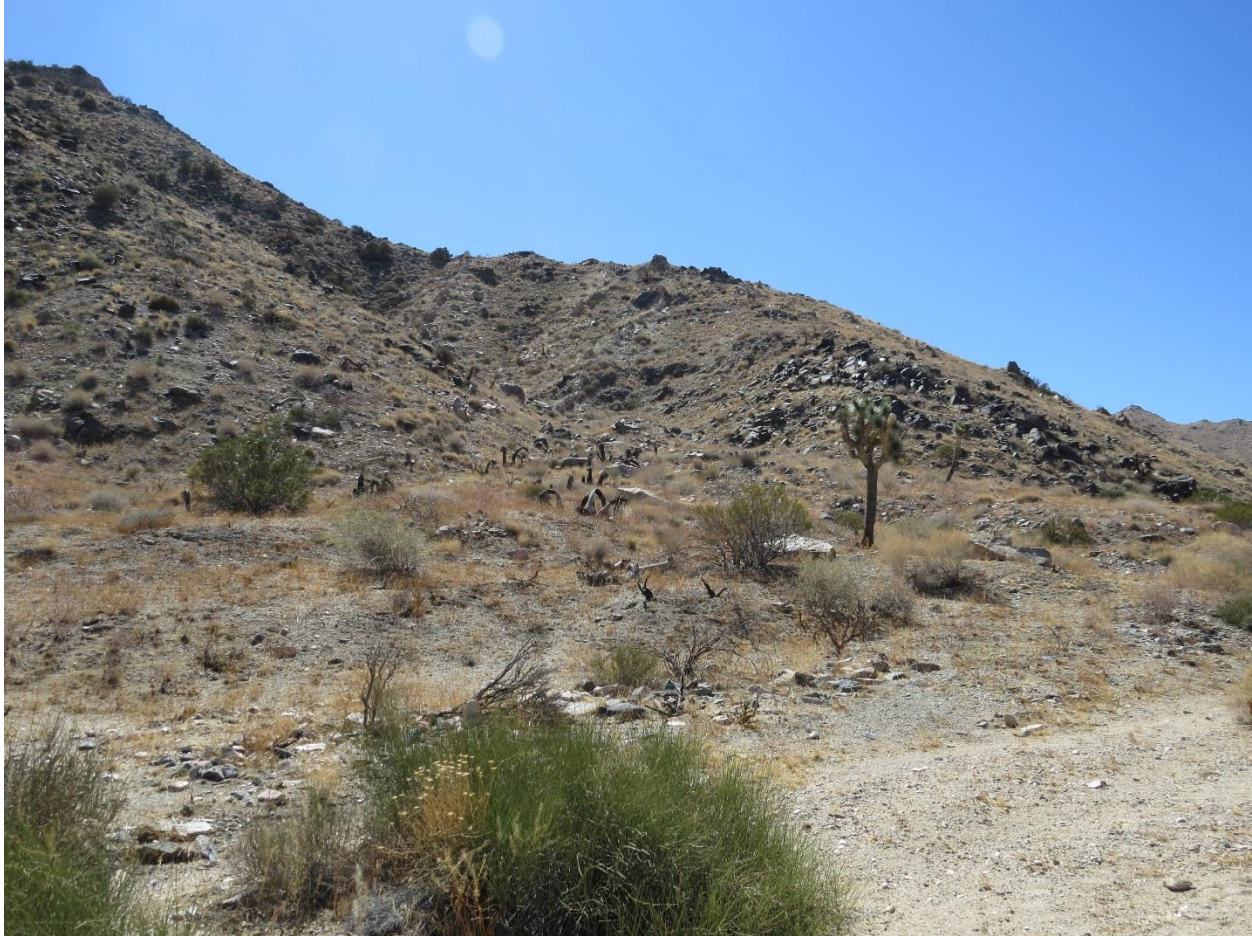
Pinyon Well, burned slope with poor recovery (photo by Lea Squires, 10 October 2016)