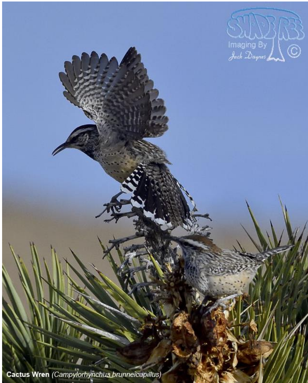
Cactus Wrens at Pinyon Well

Despite the strong changes in faunal composition, there are numerous species described by Miller and Stebbins as common or widespread that remain so, at least at a coarse-scale. Examples of birds include the Gambel's Quail, Mourning Dove, Cactus Wren, Rock Wren, House Finch, and Black-throated Sparrow, and examples of mammals include the antelope ground squirrel, Merriam's kangaroo rat, desert woodrat, cactus mouse, coyote, and gray fox.