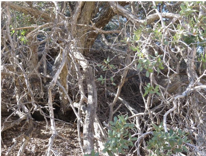
Nest of the big-eared woodrat above Pinyon Well.

However, contrary to this general pattern of decline, we also noted a few apparent range extensions. The big-eared woodrat is another chaparral species at the eastern edge of its range in Joshua Tree. It not only persists near Quail Spring, as we confirmed by finding two nests and trapping one individual, but even near the guzzler above Pinyon Well. At that site, where Miller and Stebbins did not collect the big-eared woodrat, we found a nest and trapped one animal. Our effort trapping around this nest was rewarded not only with the woodrat but two pinyon mice, representing another species characteristic of woodland and chaparral but not previously known from this site or so far southeast along the axis of the Little San Bernardino Mountains. At Quail Spring, however, where Miller and Stebbins collected 12 pinyon mice on 8 dates, we did not catch a single individual, so it seems likely that this species too has declined with the reduction of pinyon, juniper, and chaparral shrubs.