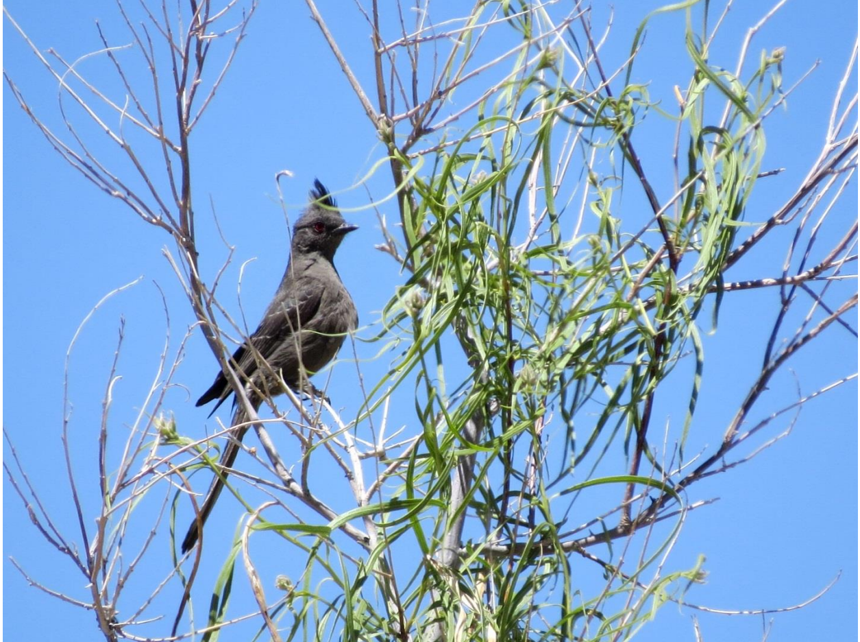
Phainopepla at Quail Spring

We deployed electronic bat-call detectors and mist-netted for three evenings at Quail Spring, where Miller and Stebbins had collected bats by stringing wires across the water-filled tank, which is now dry. The differences in methods and conditions make our results difficult to compare, but the California myotis was the only species we caught (two individuals, including one lactating female) and along with the abundant western pipistrelle or canyon bat the only species also recorded by Miller and Stebbins. They also collected four big brown bats and two specimens of the long-legged myotis. These two latter species are more characteristic of woodland rather than of desert and could have been affected by the reduction of pinyon, though we picked up possible calls of the big brown bat with our electronic detectors. By contrast, we recorded definite calls of the Mexican free-tailed bat, pallid bat, and hoary bat, and possible calls of the silver-haired bat and western small-footed myotis. The hoary and silver-haired bats are expected in Joshua Tree only as migrants, and were perhaps paralleling the many species of birds we found migrating at Quail Spring in late April.