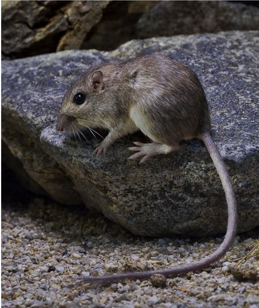
Baja pocket mouse ( Chaedodipus rudinoris ), a new species for Joshua Tree National Park (photo by Jack Daynes, Cottonwood Spring, 26 September 2016)

Present in Joshua Tree in the 1940s but scarce was the Common Raven. In spite of their considerable effort at both Pinyon Well and Quail Spring, Miller and Stebbins did not record it at either site. Now it is common. At Pinyon Well we recorded it on most days, up to 4 per day, and found one used nest. At Quail Spring we saw no fewer than 4 daily and on two days saw large flocks of 40 to 55 individuals, one occasion mobbing a Golden Eagle. Another apparent increase is of the Phainopepla, at least at Quail Spring. Although Miller and Stebbins described the Phainopepla as common locally, they recorded it at Quail Spring on only 2 dates (Feb 11 and May 21), but we noted it daily with up to 25 per day—one of the most abundant and conspicuous birds.