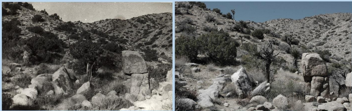
Pinyon Well, left photo “a characteristic S-facing slope above Pinyon Wells,” Robert C. Stebbins, October 1945 vs. right photo showing thinning juniper on these same unburned slopes, Lori Hargrove, 11 October 2016.

Pinyon Well and Quail Spring are similar in that both lie near the lower edge of the zone of pinyon/juniper woodland. At both sites we covered elevations between about 3600 and 4200 feet. They are also similar in having extensive areas burned, followed by minimal recovery of pinyon and juniper trees. From Pinyon Well, we also hiked to the ridgeline of the Little San Bernardino Mountains, up into an unburned zone mainly between 4200 and 4700 feet elevation. In 1945, Miller noted that the scrub oak was “with heavy acorn crop,” which was not the case in 2016. Even in unburned areas above Pinyon Well, dying off of juniper trees, presumably from the drought, was conspicuous. Another important change is that both sites had more surface water historically—the well at Pinyon Well and the tank at Quail Spring are now both dry.