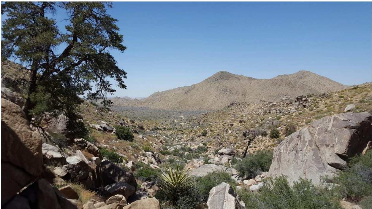
Canyon above Quail Spring with lone pinyon tree