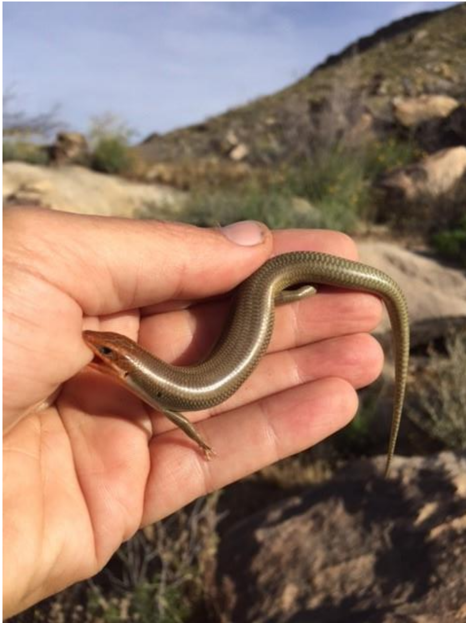
Gilbert's Skink at Quail Spring