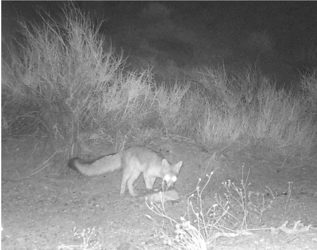
Gray Fox, Pinyon Well