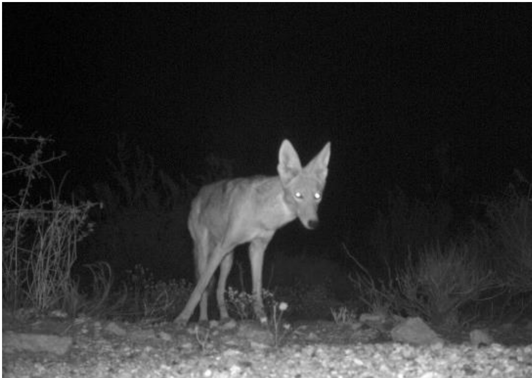
Coyote, Pinyon Well