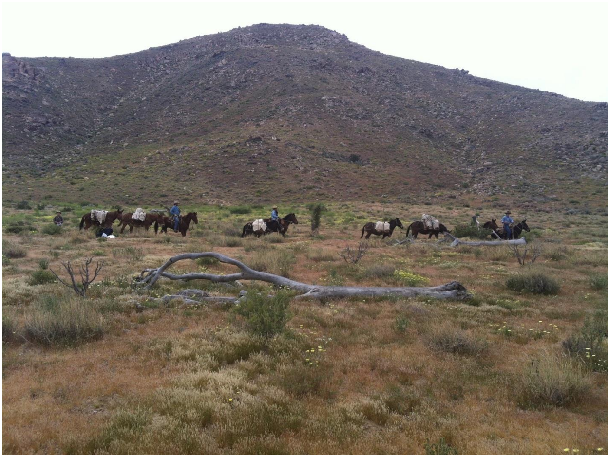
Mule team carrying gear to Quail Spring