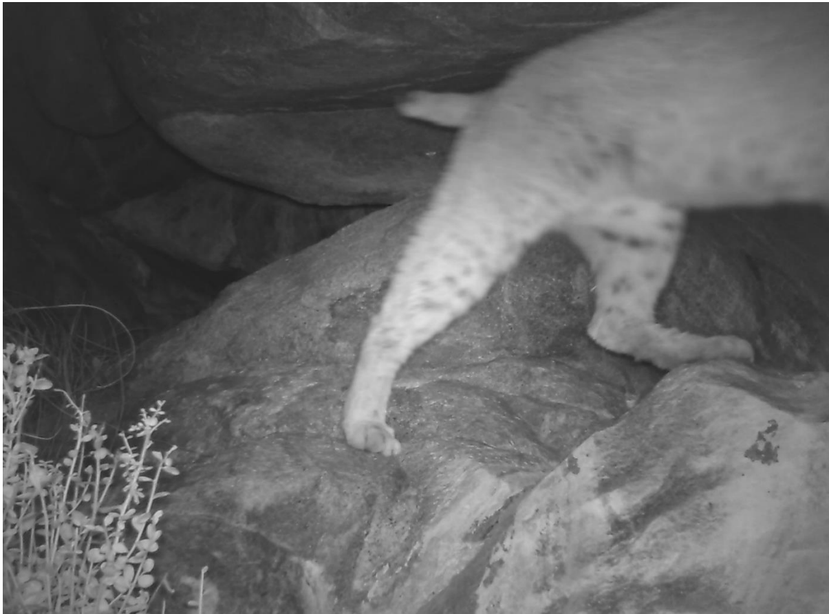
Bobcat, Quail Spring (too quick for motion-detection camera)

Many typically desert species of both birds and mammals remain numerous and in April were taking advantage of last winter's rain and the following glorious bloom to reproduce. Aside from the California chipmunk, pinyon mouse, and long-legged myotis, we recorded every species of mammal listed for Quail Spring by Miller and Stebbins. These include the bobcat, picked up by two of our three motion-detecting cameras, and the bighorn sheep, of which we noted an old, weathered skull.