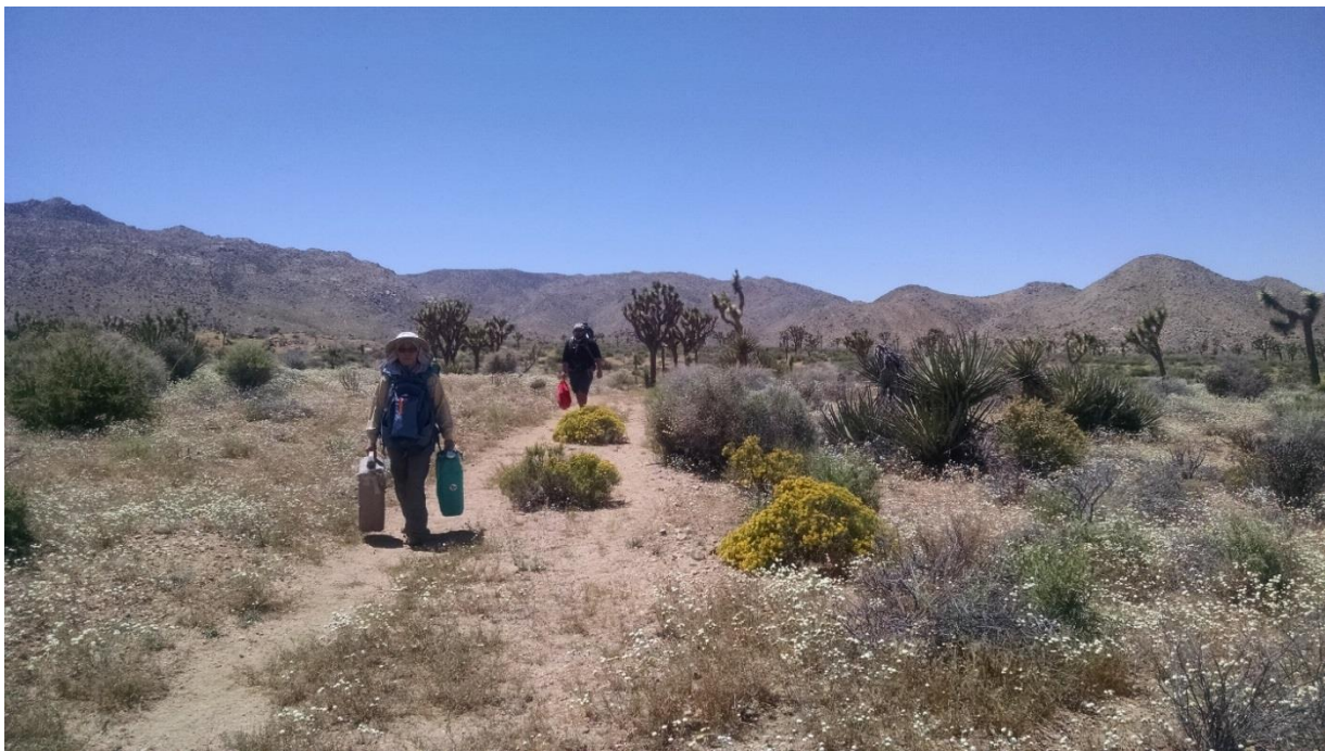
Volunteer porters carrying gear back from Quail spring